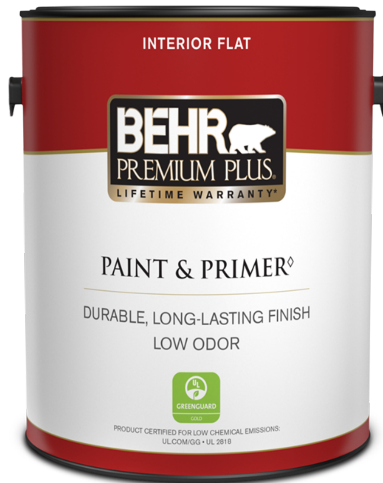
Behr Premium Plus Interior Flat Paint & Primer