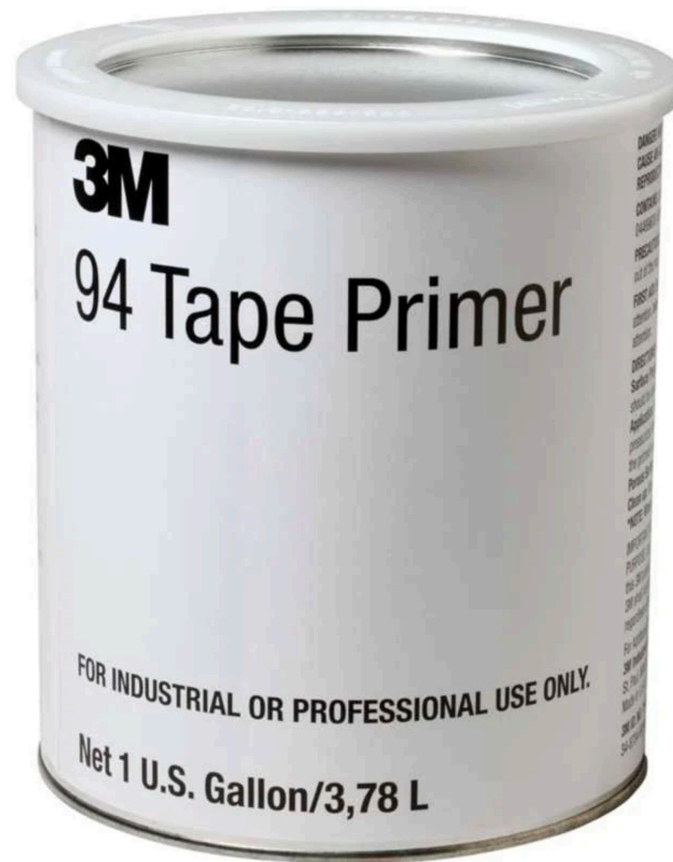
Extra Strong Tack