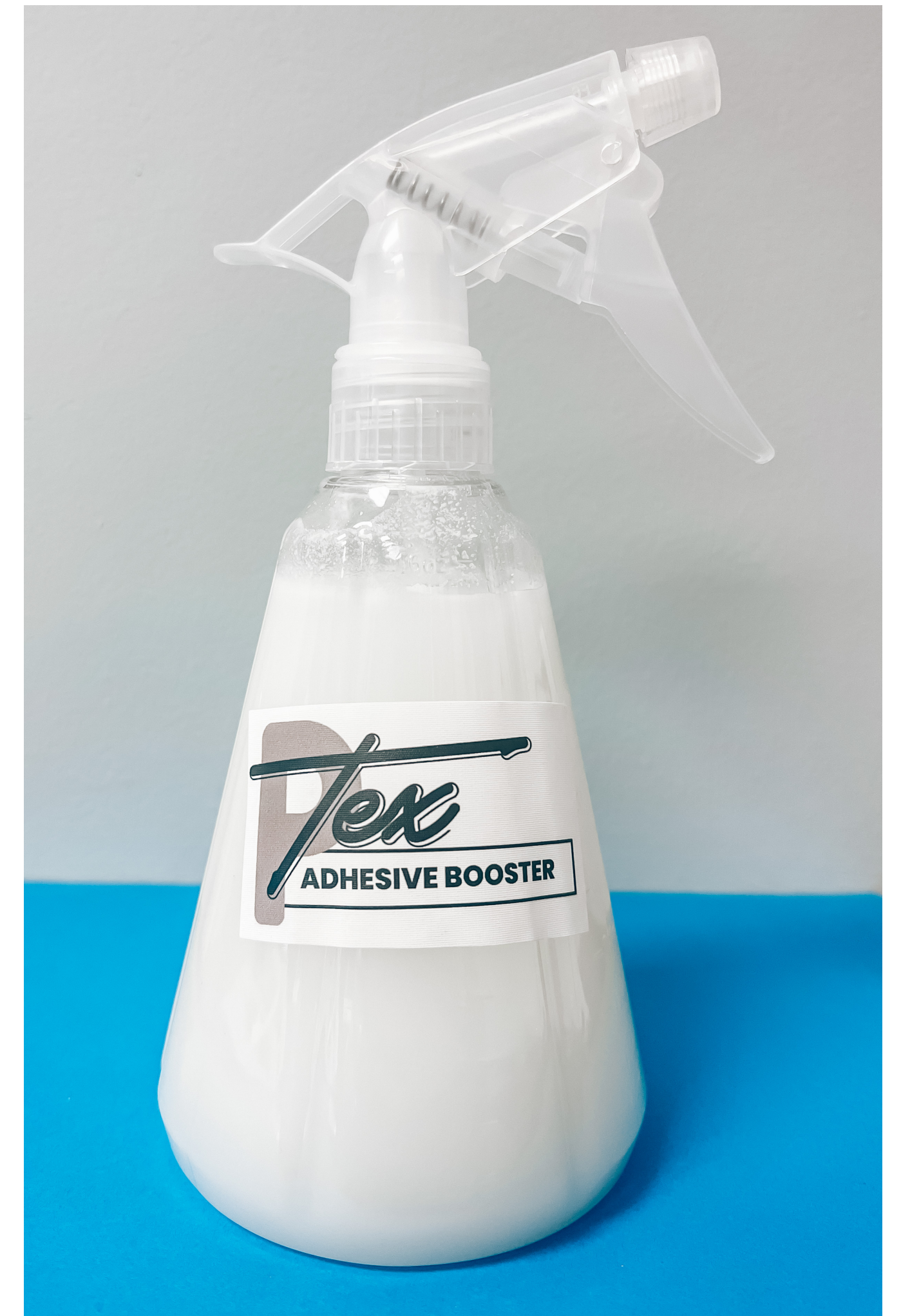
PTex Adhesive Booster

*Contact orders@phototexgroup.com to order and learn more!